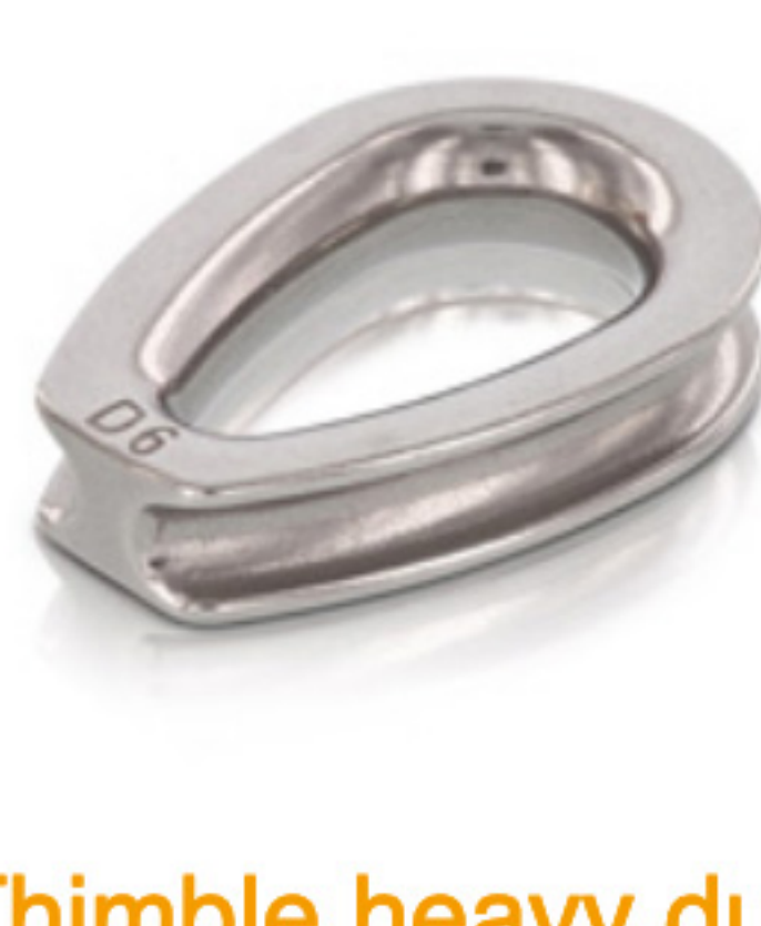
Thimble heavy duty 81505844

Duplex 1.4462, PRE value: 35 D6, MT series