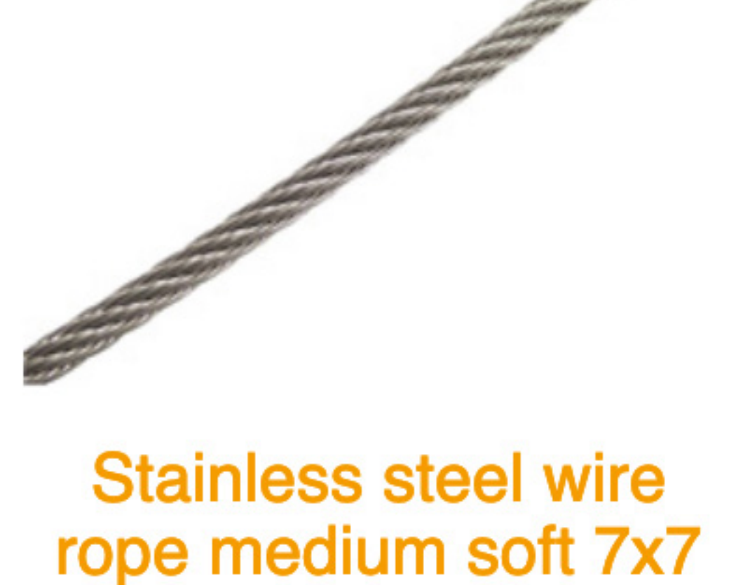
Stainless steel wire rope medium soft 7x7 81505544

Duplex 1.4462, PRE value: 35 D6, (250 m), MT series