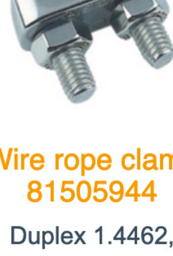
Wire rope clamp 81505944

Duplex 1.4462, PRE value: 35 D6, MT series