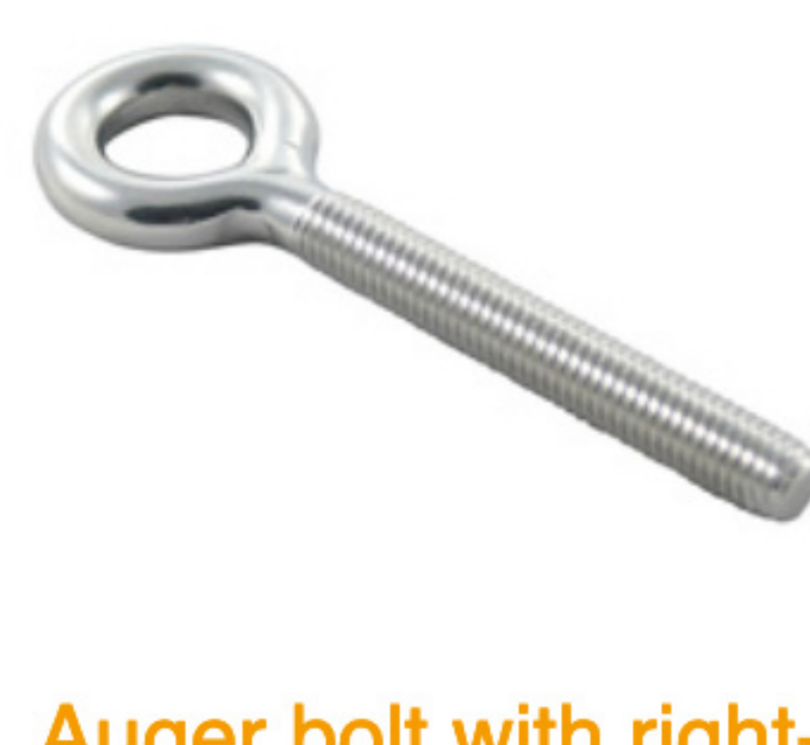
Auger bolt with right-hand thread 81510744

Duplex 1.4462, PRE value: 35 D6, MT series