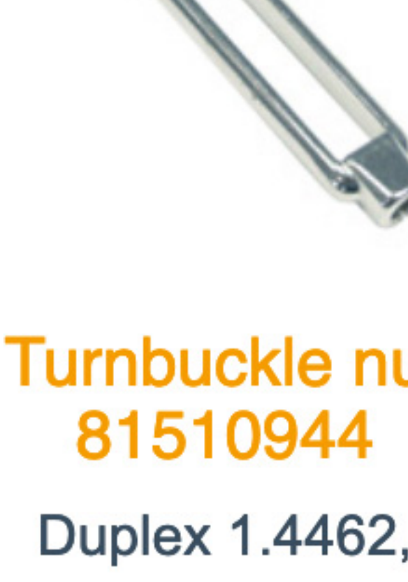
Turnbuckle nut 81510944

Duplex 1.4462, PRE value: 35 D6, similar to ISO 1480, MT series