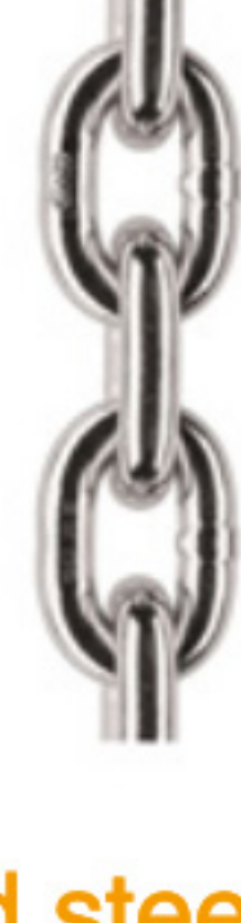
Round steel chain short link 831544

Duplex 1.4462, PRE value: 35 D6 (1 m), similar to ISO 4565